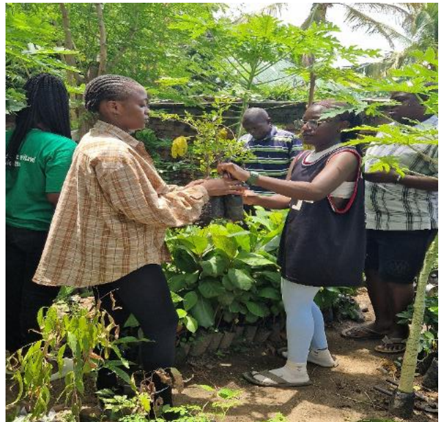
Figure 1: Pictures captured during the seedling purchase

After procurement, the seedlings were transported to the planting sites and temporarily stored under shade to prevent dehydration. The planting area was then prepared by clearing weeds and digging planting holes at recommended spacing